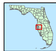
Tampa Bay, Florida