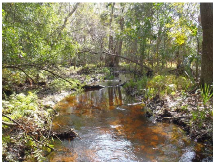
Figure 4. TP 220

The Creek at site TP220, further upstream, is a first order stream flowing through a cypress flood plain (Figure 4). This site was also predominately sandy bottomed with 10% available habitat (snags, roots and leaves). The HA score was 126, which falls in the low end of optimal conditions. Water velocity was 0.3 m/sec. The riparian zone was natural and wide enough on both sides to provide adequate protection from storm water runoff. At TP220, the SCI score was only 26, indicating disturbance to the macroinvertebrate community. However, at this location the creek is a first order headwater stream that is likely to go dry seasonally. We could not be sure that the creek had been flowing for a minimum of three months prior to sampling, allowing for adequate colonization by macroinvertebrates (and as specified in our Standard Operating Procedures (SOP) and the resulting low SCI score may not be accurately assessing the macroinvertebrate community.