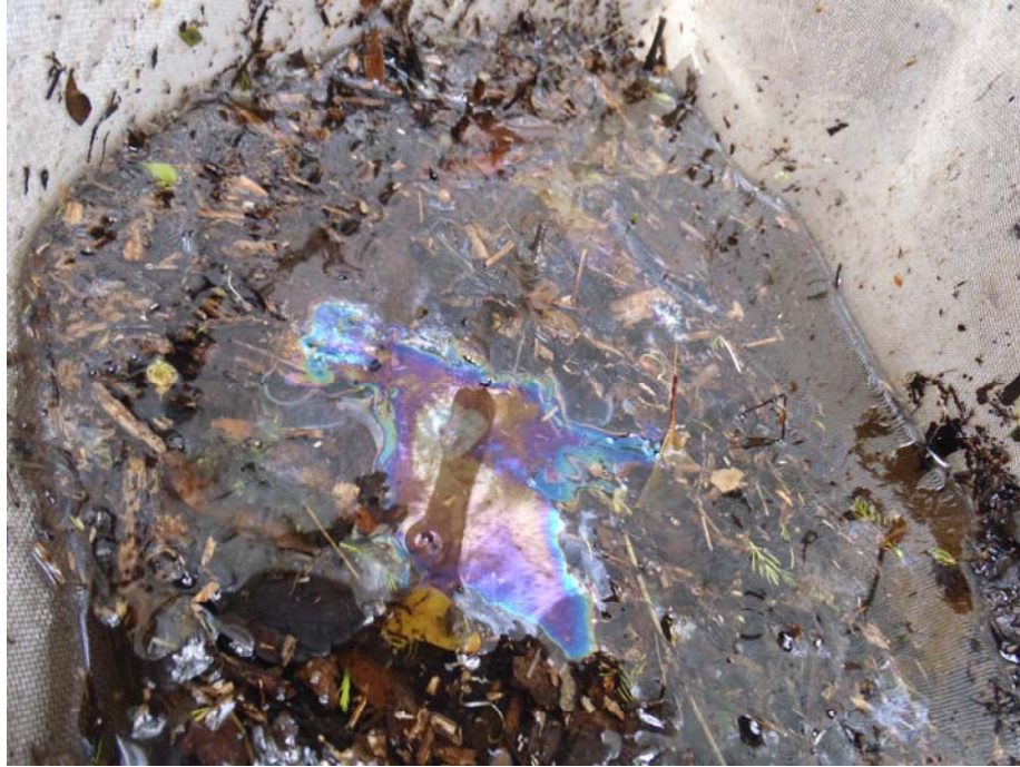
Figure 5. Oil slick at TP11022S

There were only two sensitive species at TP11022S and one at TP220. Neither site had any long lived species, although mussels were observed at TP220, but not present in the analysis. TP11022S was dominated by the midge, Rheotanytarsus sp. and TP220 was dominated by Hyaella azteca , an amphipod grazer. During the course of rinsing leaves out of the sample at TP11022S, an unusual oil slick was observed (Figure 5), accompanied by the odor of gasoline.