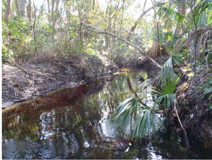
Figure 3. TP11022S

The Creek at site TP220, further upstream, is a first order stream flowing through a cypress flood plain (Figure 4). This site was also predominately sandy bottomed with 10% available habitat (snags, roots and leaves). The HA score was 126, which falls in the low end of optimal conditions. Water velocity was 0.3 m/sec. The riparian zone was natural and wide enough on both sides to provide adequate protection from storm water runoff. At TP220, the SCI score was only 26, indicating disturbance to the macroinvertebrate community. However, at this location the creek is a first order headwater stream that is likely to go dry seasonally. We could not be sure that the creek had been flowing for a minimum of three months prior to sampling, allowing for adequate colonization by macroinvertebrates (and as specified in our Standard Operating Procedures (SOP) and the resulting low SCI score may not be accurately assessing the macroinvertebrate community.