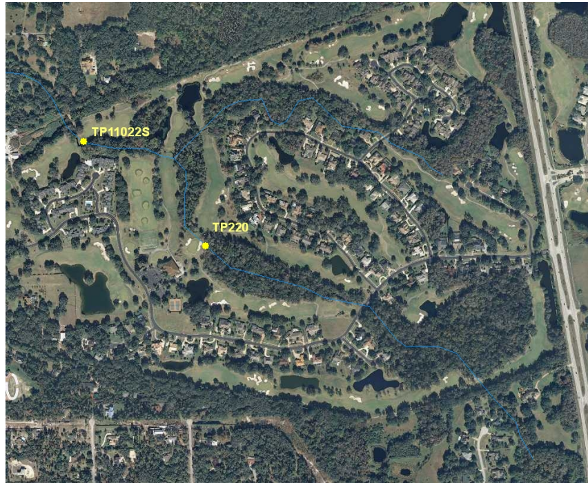
Figure 2. Location of sites in Hollin Creek

Hollin Creek is a second order stream in northern Pinellas County that flows in a westerly direction into Salt Lake, located within the Anclote River basin (Fig.1). The Creek drains a cypress swamp and flows through a golf course community prior to emptying into the Anclote estuary.