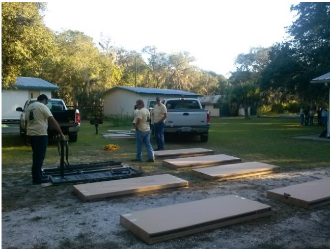
Ready to make tables & benches.