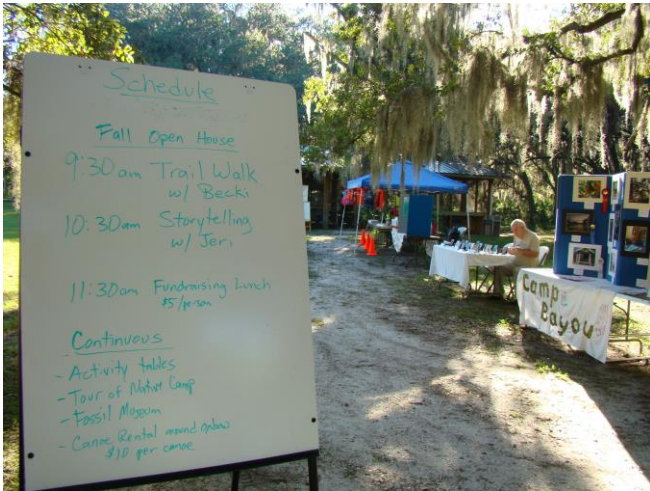
Lots to do at the Fall Open House