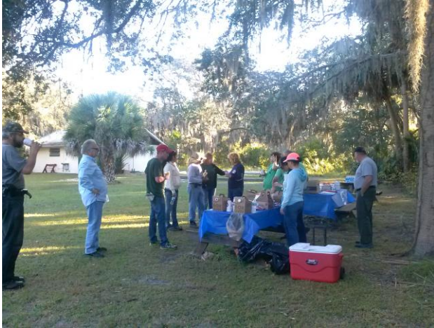
Starting the day...