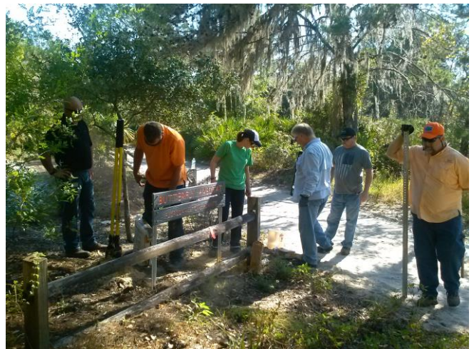
Installing butterfly habitat signs.