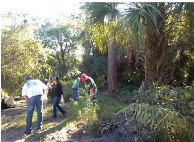
Leveling the hog damage.