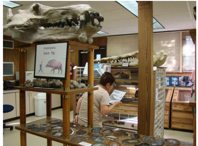
Exploring the Fossil Museum