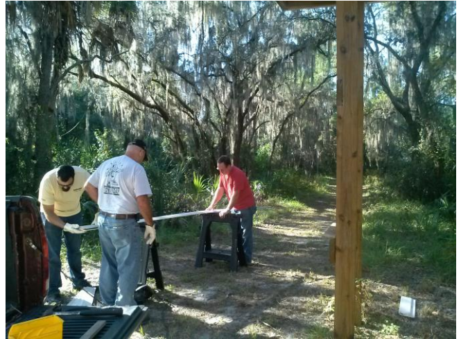
Putting finishing touches on kiosk.