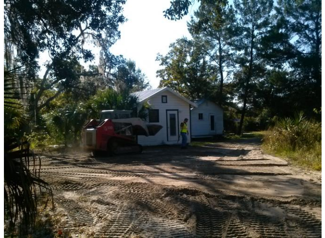
Taking care of erosion issues.