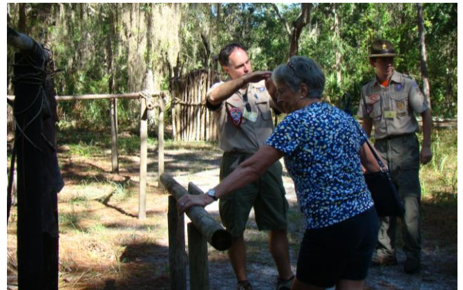
Native Camp Tours with Troop 2140