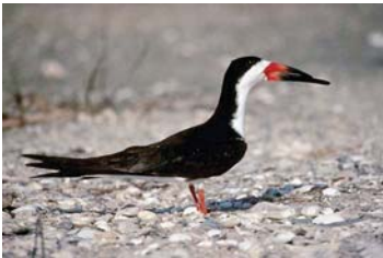
Black skimmer

Help us maintain the valuable amenities of the Preserve as you enjoy the beaches, fish the shallows, and watch the birds.