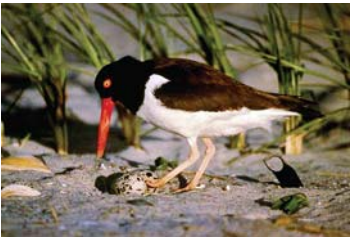
American oystercatcher

Thousands of protected migrating and wintering shore and sea birds use the Preserve during the fall, winter and spring months. Nesting species that enjoy special protection by the State include the American oystercatcher, least tern and black skimmer. All bird species benefit when humans do not disturb them. Please remember that we are visitors to an area they call home.