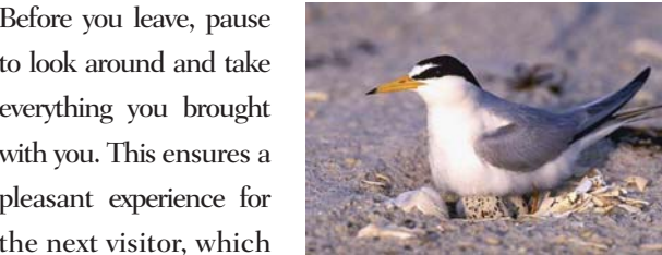
Least tern

Help us maintain the valuable amenities of the Preserve as you enjoy the beaches, fish the shallows, and watch the birds.