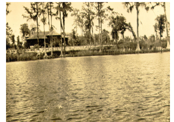
The undeveloped shoreline of Lake Platt in the 1920's bears little resemblance to the shores of the lake today.

"We also bought one hundred pound ice blocks for the ice box, as well as grain for the chickens and cows at the feed store. Later we could get grain at Sinclair Hills on Nebraska Avenue. It was before the time of supermarkets, of course. There was one large market store downtown, actually very close to where the old courthouse is now. . . ."