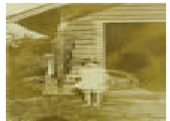
Alligators were a more common feature of Lake Platt in the

"I was my daddy's 'boy.' I would ride behind the mule, cut