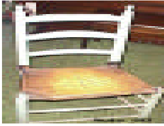
An alligator-skin chair is a family heirloom and aided many Platt and Robles children in taking their first steps.

the grass, [and go] alligator hunting in the boat. It was not the rowboat, we didn't use oars then. It was just one paddle, but he taught me to paddle. If you lift the oar, it drips water and the alligator would swim under the water. He could hear it... You could shine a light on the lake and see alligator eyes everywhere because they always kept their heads up at night... I would paddle and we'd get within about twenty feet... and they'd come up and he'd shoot them between the eyes. The only way you can kill them is between the eyes... So, he'd drag the alligator in, hang it up there where the water pump was, he'd string it up there and skin it."