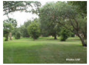
Citrus trees planted at the turn of the century still produce fruit today.

" [The trees] were all big enough, that in the big freeze of 1895, they froze down. They cut them off and the trees came back up . . . one trunk, and then it sprouted like an oak tree. They grew so tall that one hundred-foot ladders were required to harvest the fruit. Not many orange trees do that. Today's trees are budded and they branch way down."