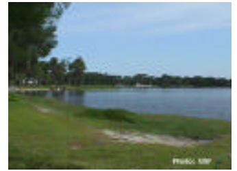
The north shore of Platt Lake looking east has a different aesthetic than at the turn of the century.

Magdalene. It is a 63-acre lake rimmed by cypress and oak, with a small island in the middle. The sisters reminisce about the island, "There was a shallow spot out there. Now it is an island with all the grasses on it...It was always under water, before the water table dropped." The 'shallow spot' was a destination for children growing up on the lake. Maurine explains, "We swam there all the time. . . . We didn't go around the road to meet each other, we went across the lake. We'd stand here on the edge of the lake and say 'Whoo, whoo, whoo!' They'd hear it because the water is just like a telephone. We'd say, 'Let's go swimming in the shallow spot!'" At times, the water was deep enough to dive from a tower they built there. Mary Louise picks up the memory's thread, "They'd swim across and we'd take a boat...an old wooden boat, good and flat so it wouldn't turn over...and we'd meet them over there." Maureen adds, "Recently, with developments west of here, it has become a bird rookery. In the evening it looks like the bushes have white blossoms."